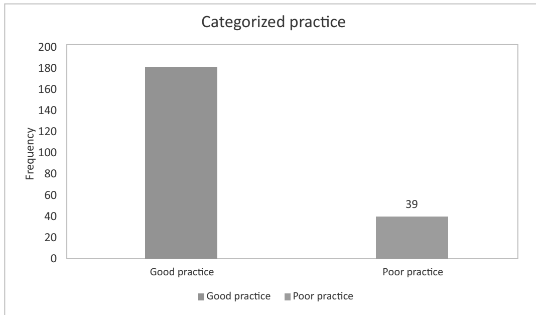
Fig.2: Case detection practices of respondents on childhood tuberculosis

Others 1 = awareness and giving health education